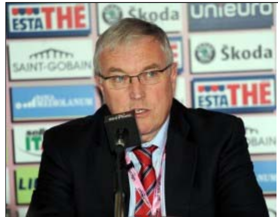
Pat McQuaid, Giro d'Italia press conference, May 25 2010

"I don't believe there was a conflict of interest. The machine is still in use today to test riders before major races. If there is any money left over it is still in the account of the UCI."